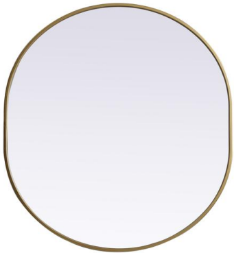
Item No:MR2A3036BRS (Brass)